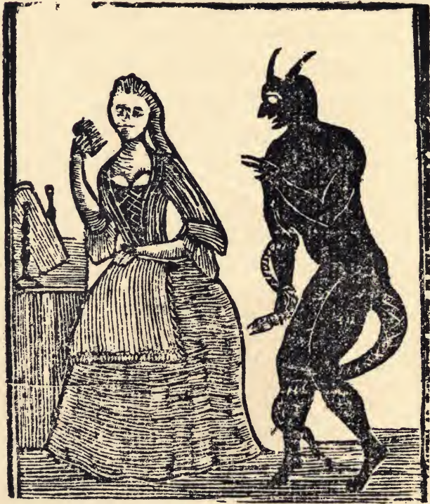
The Devil and the Disobedient Child